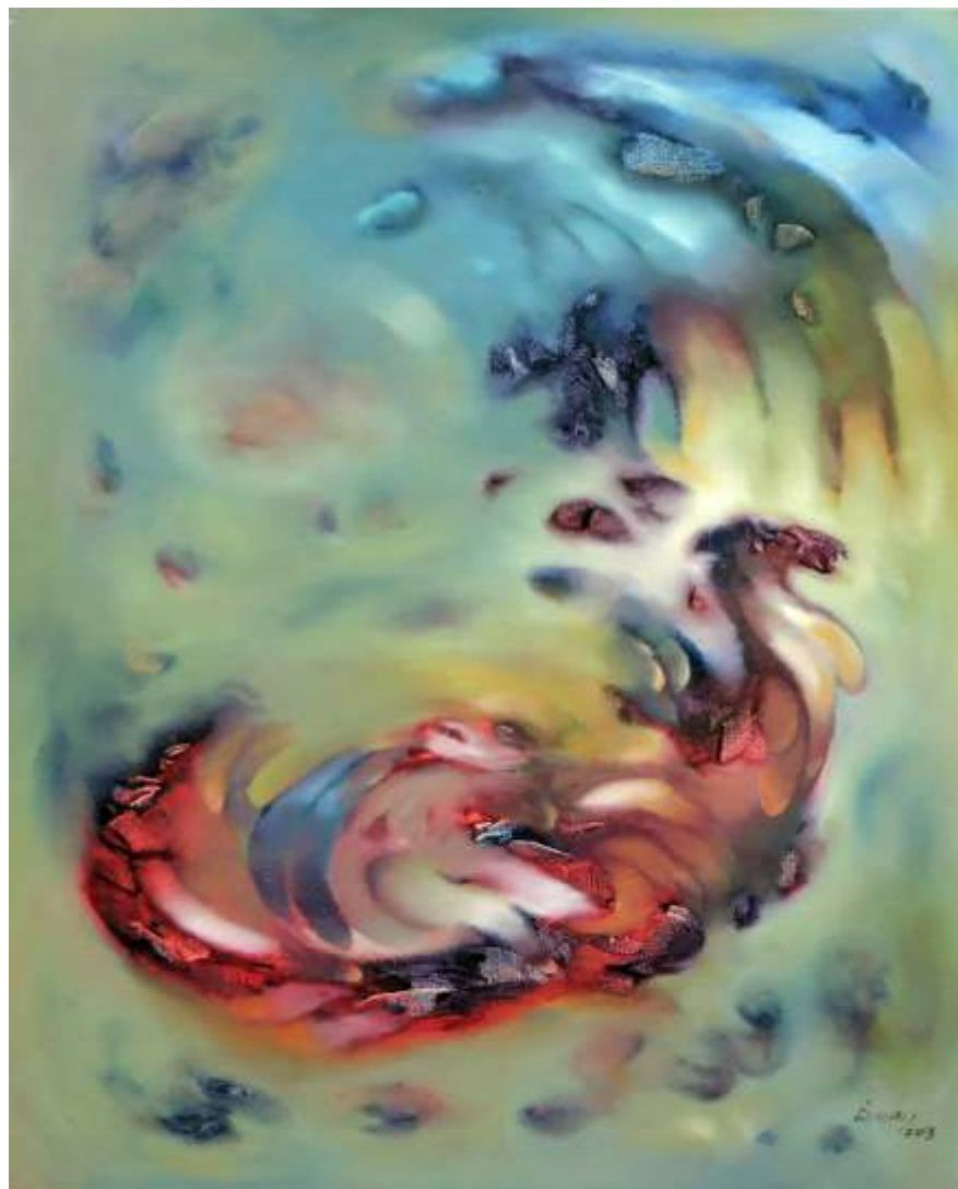
Unititled 10 Oil on canvas 2013 24" x 30" Price on request