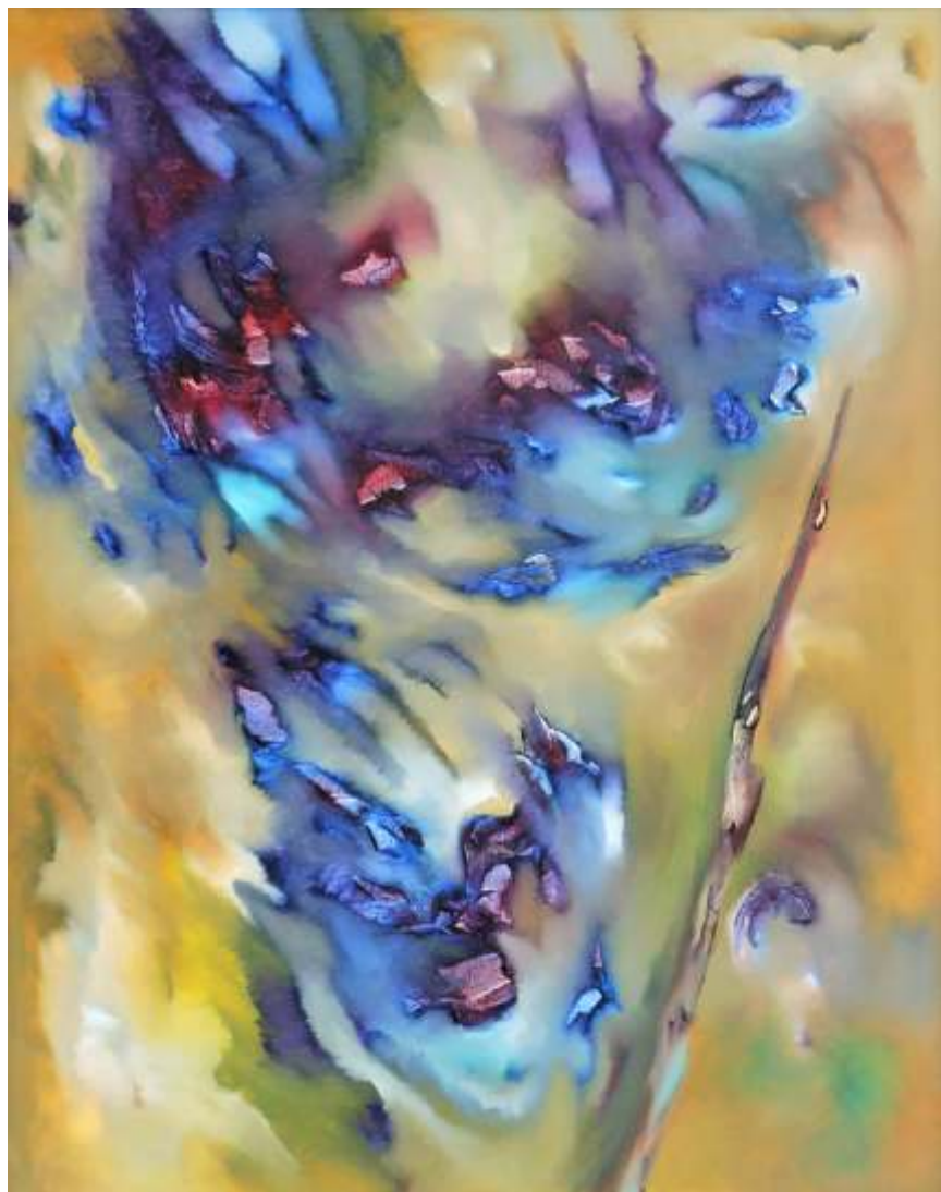
Untitled 9 Oil on canvas 2013 24" x 30" Price on request