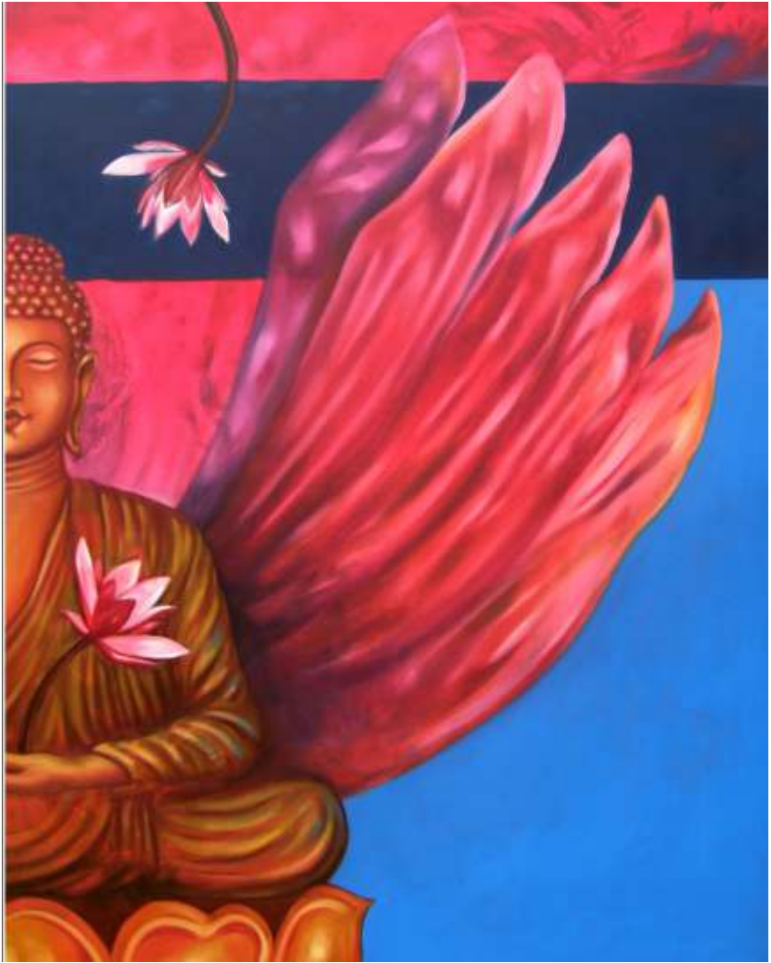
Yogadarshana 93 Acrylic and Oil on Canvas 2012 48" x 60" Price on request