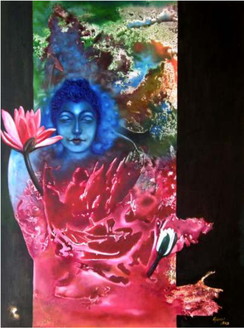
Yogadarshana 92 Acrylic and Oil on Canvas 2012 36" x 48" Price on request