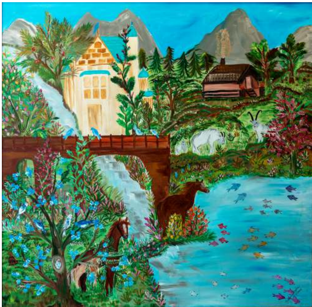
RAY OF HOPE 48"x48" Acrylic on Canvas Rs. 156800/-