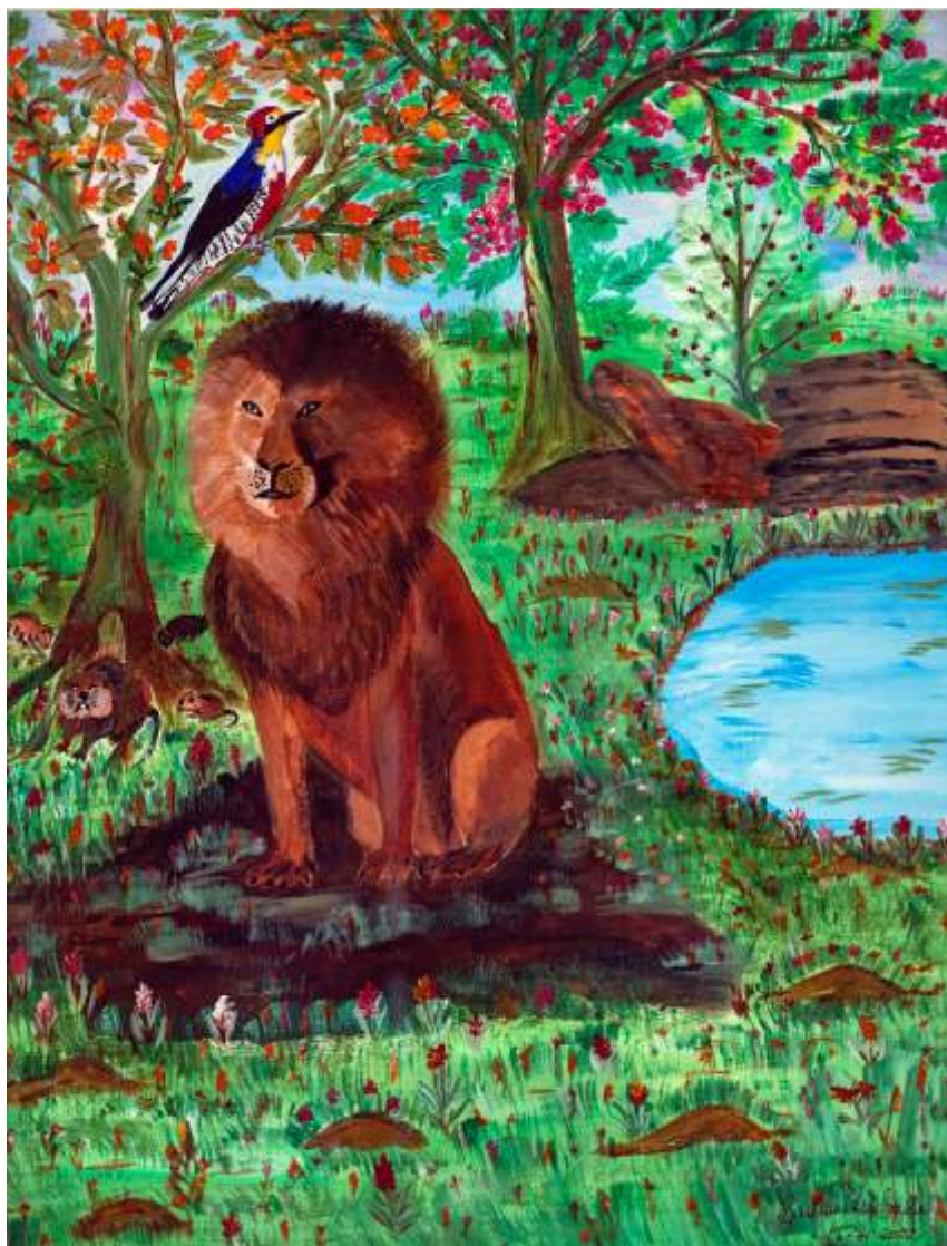
TROUVAILLE 24"x18" Acrylic on Canvas Rs. 117600/-