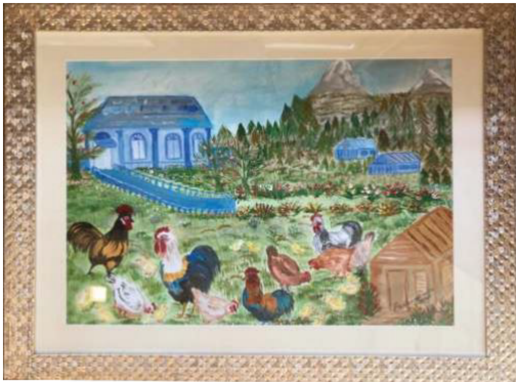
SERENE COOP 18"x24" Acrylic on Canvas Rs. 125440/-