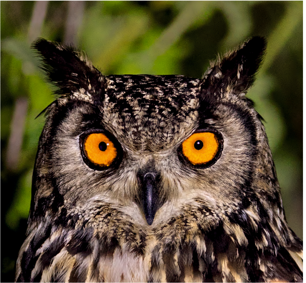
Watch Out 3ft x 2.2ft Photography Rs. 39984/-