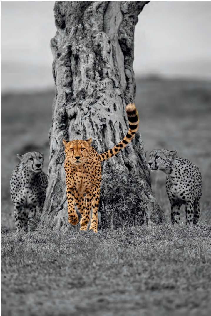
Tail's Up 3ft x 2.2ft Photography Rs. 39984/-