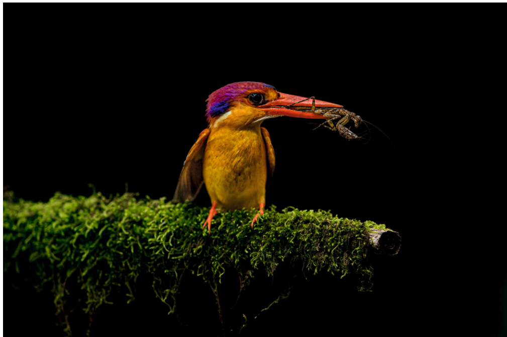
The Catch 3ft x 2.2ft Photography Rs. 39984/-