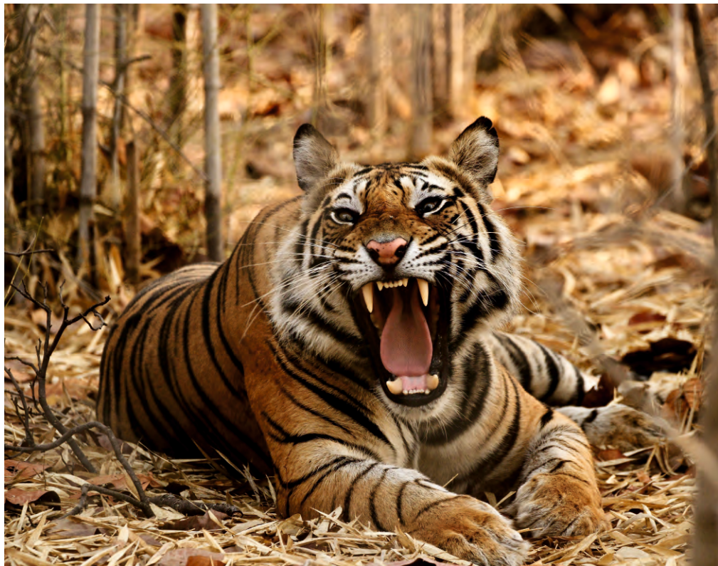
Wide Open 3ft x 2.5ft Photography Rs. 45158/-