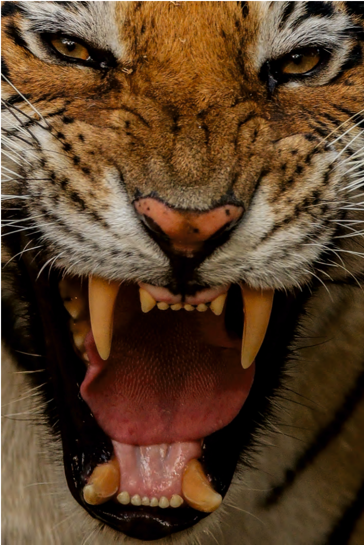
The Roar 3ft x 2.2ft Photography Rs. 39984/-