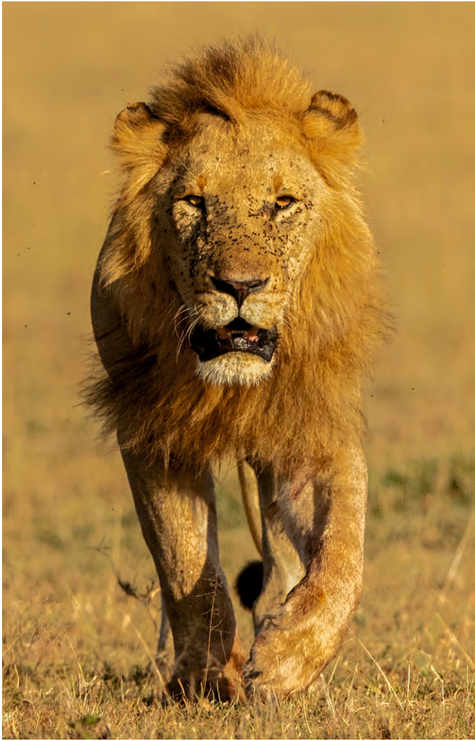
The lion King 3ft x 2.2ft Photography Rs. 39200/-