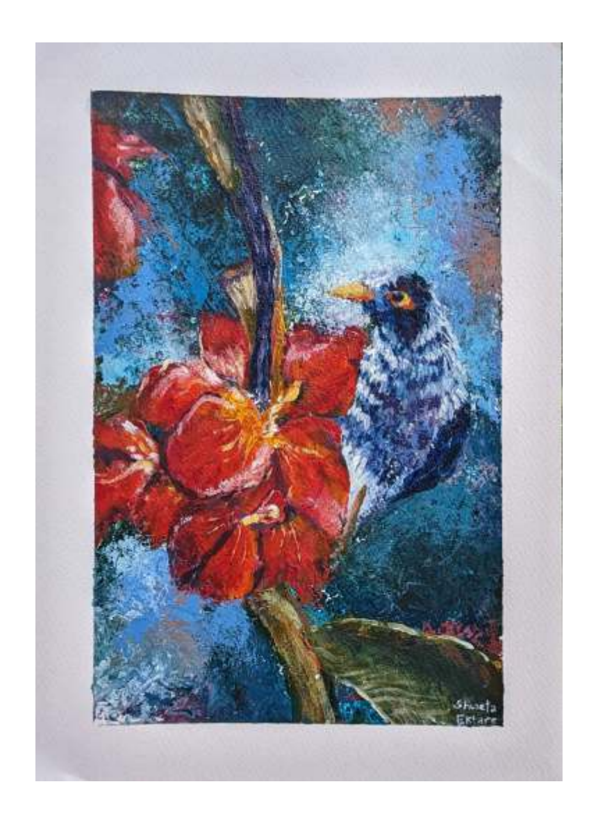
Feathered Bloom Material and Medium: Acrylic on Mixed Medium Paper Size: 8x11" (without frame)