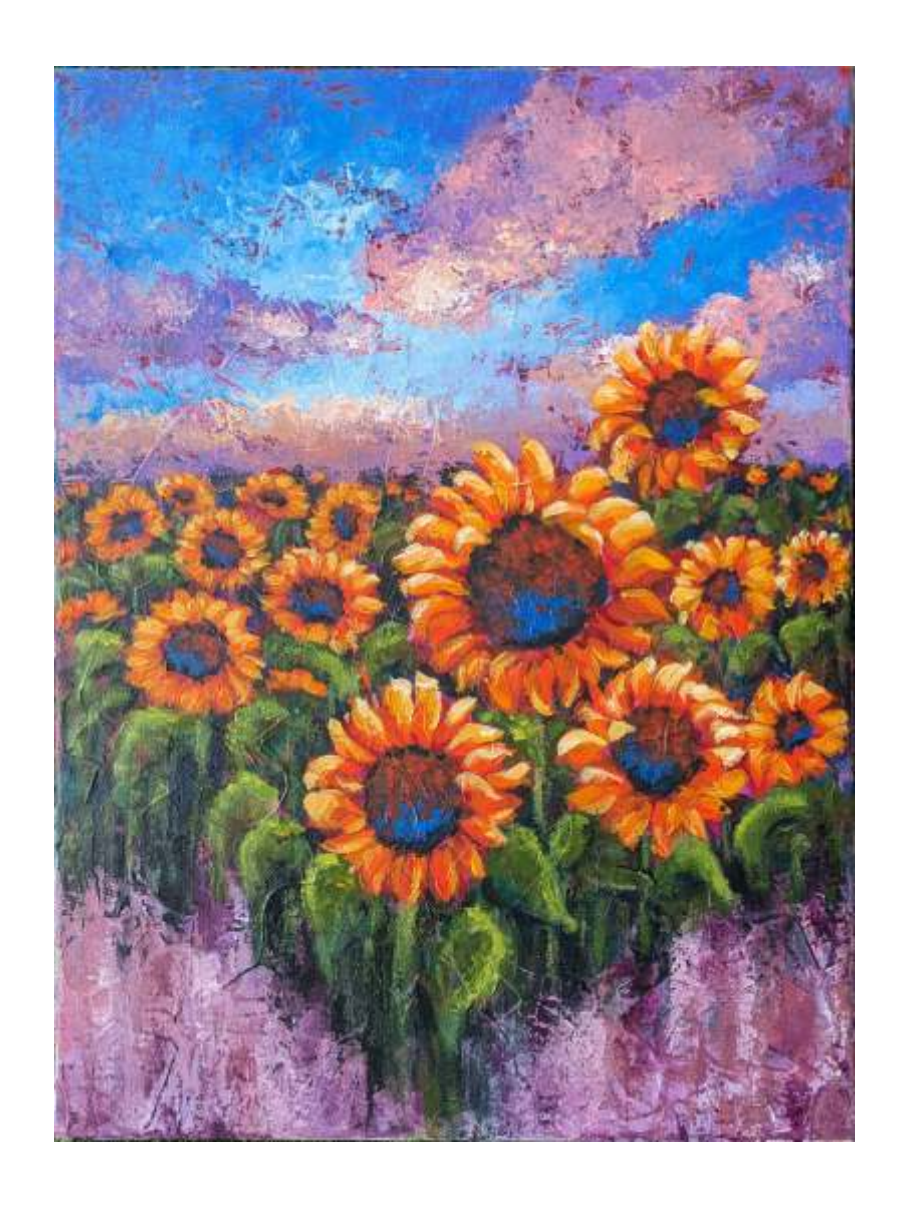
Field of Sunshine Material and Medium: Acrylic on Canvas