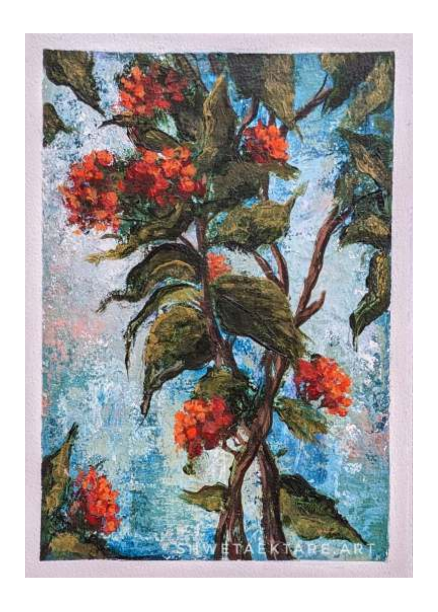
Reds of Royals Material and Medium: Acrylic on Mixed Medium Paper Size: 7x10" (without frame) Rs.7,840/-