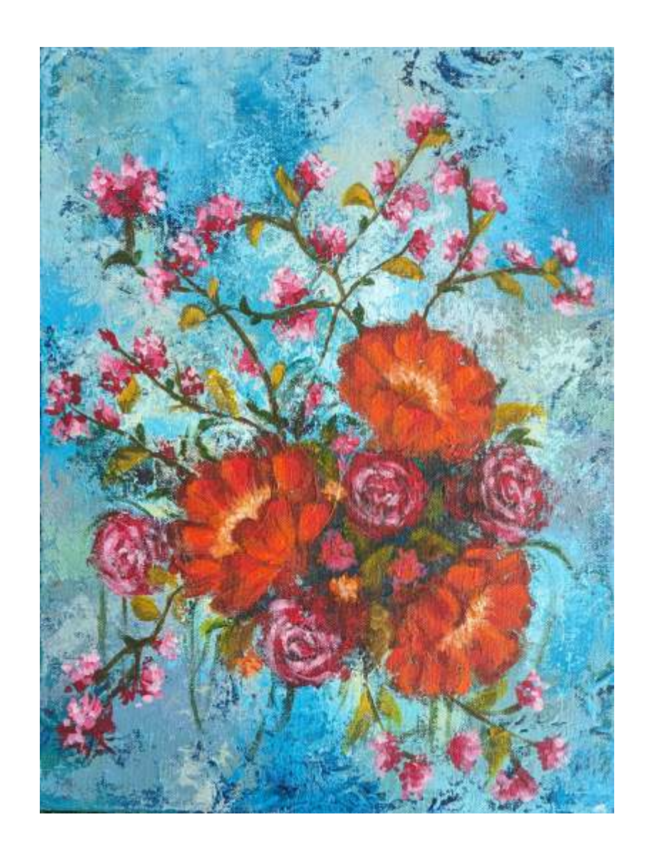
Floral Connection Material and Medium: Acrylic on Canvas