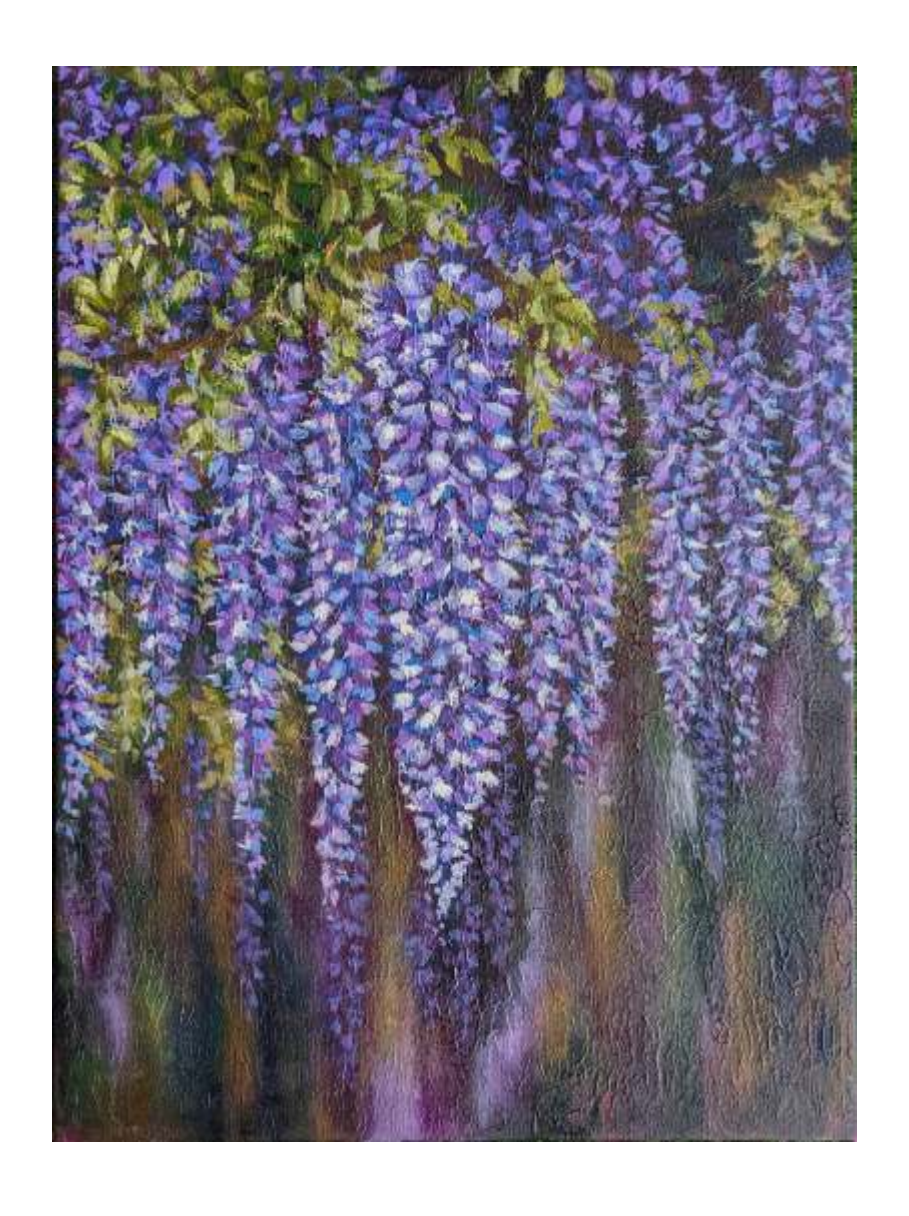
Lavender Dreams Material and Medium: Acrylic on Canvas