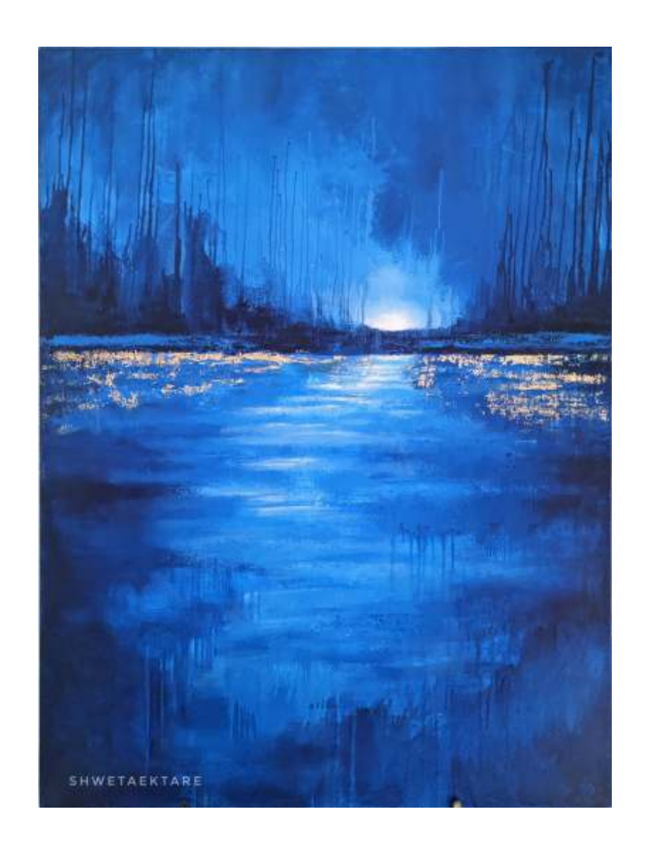
Tranquil Echos Material and Medium: Acrylic on Canvas