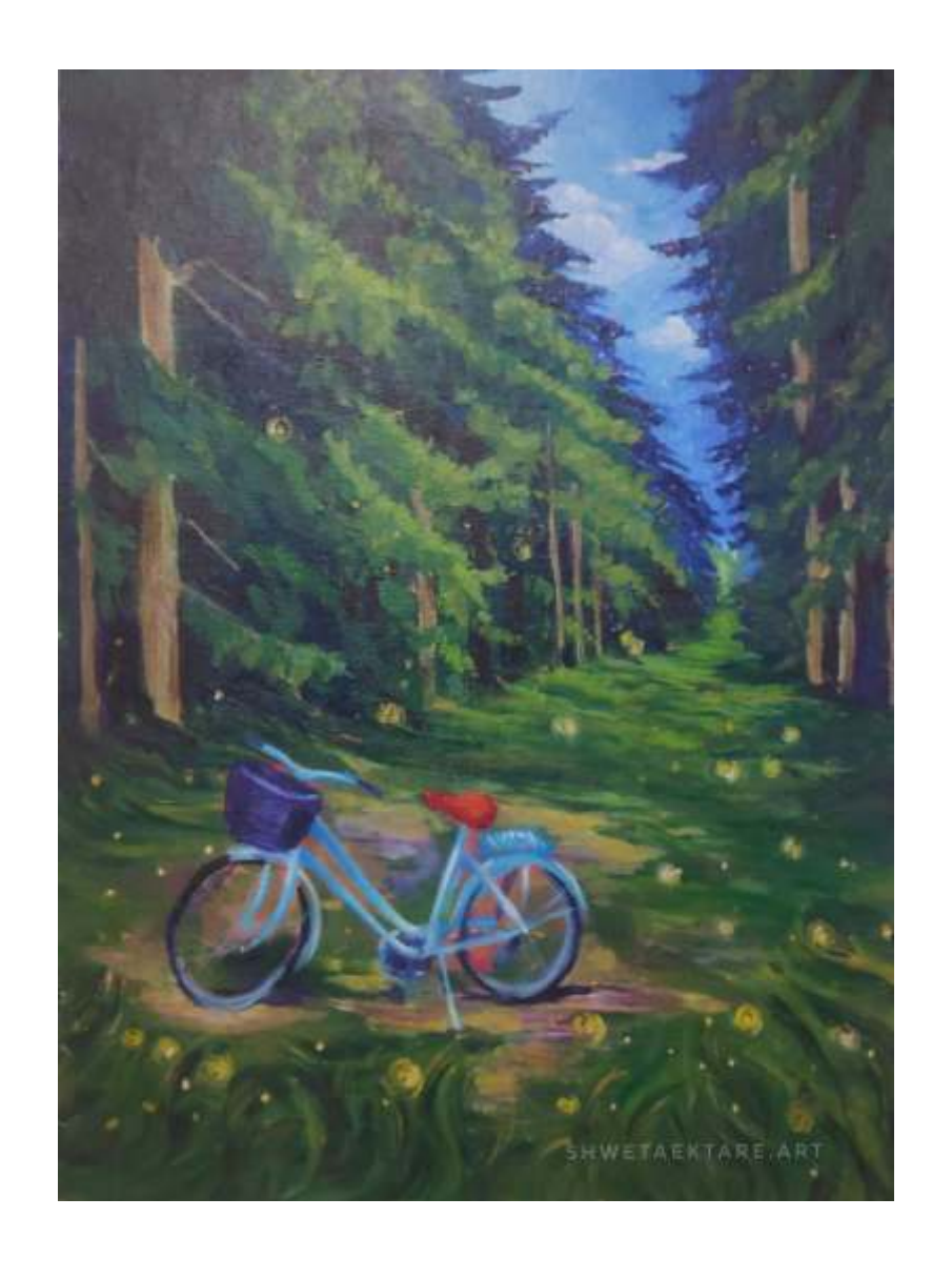
Road Not Taken Material and Medium: Acrylic on Canvas Size: 16x12" (without frame)