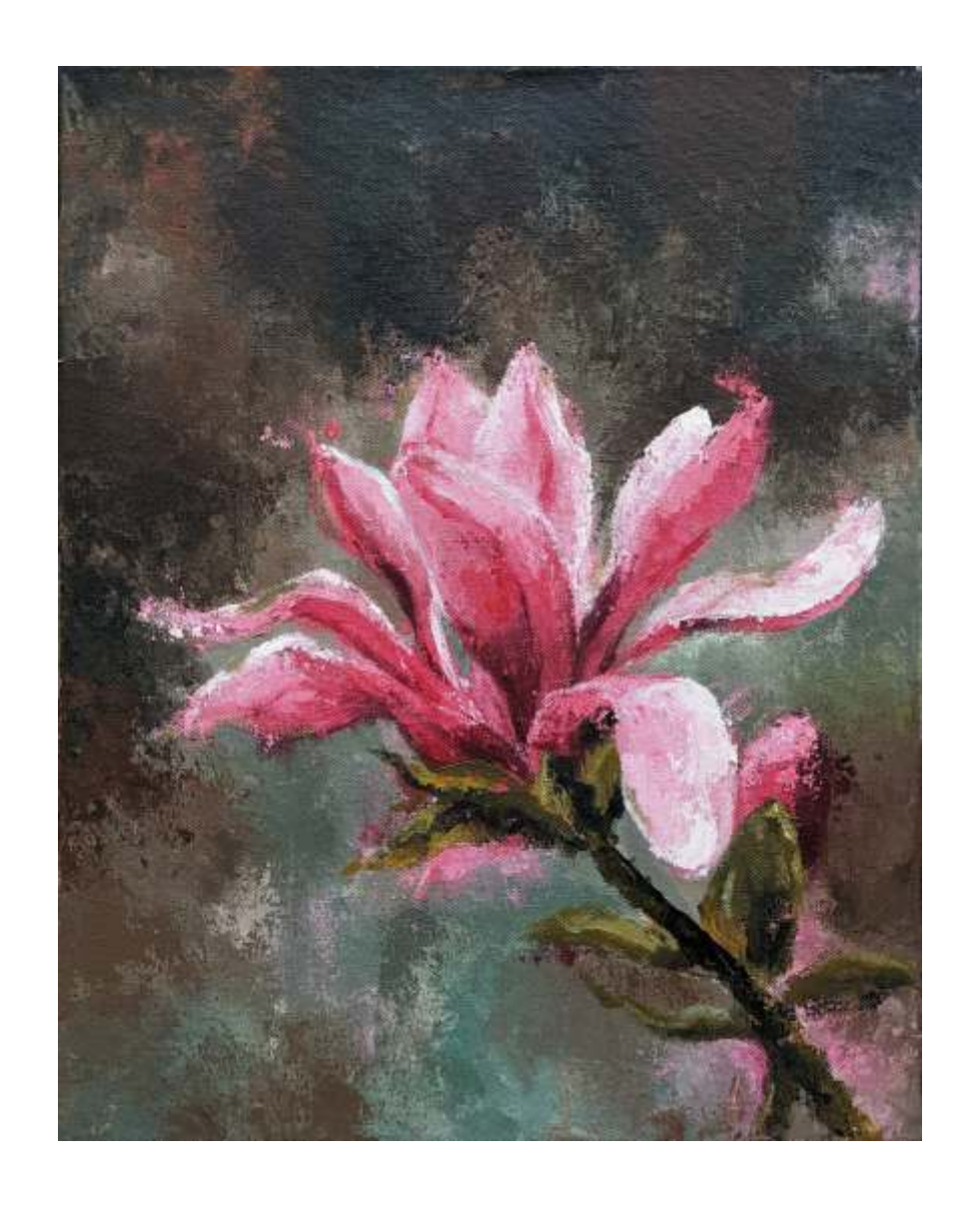
Magnolia Material and Medium: Acrylic on Canvas