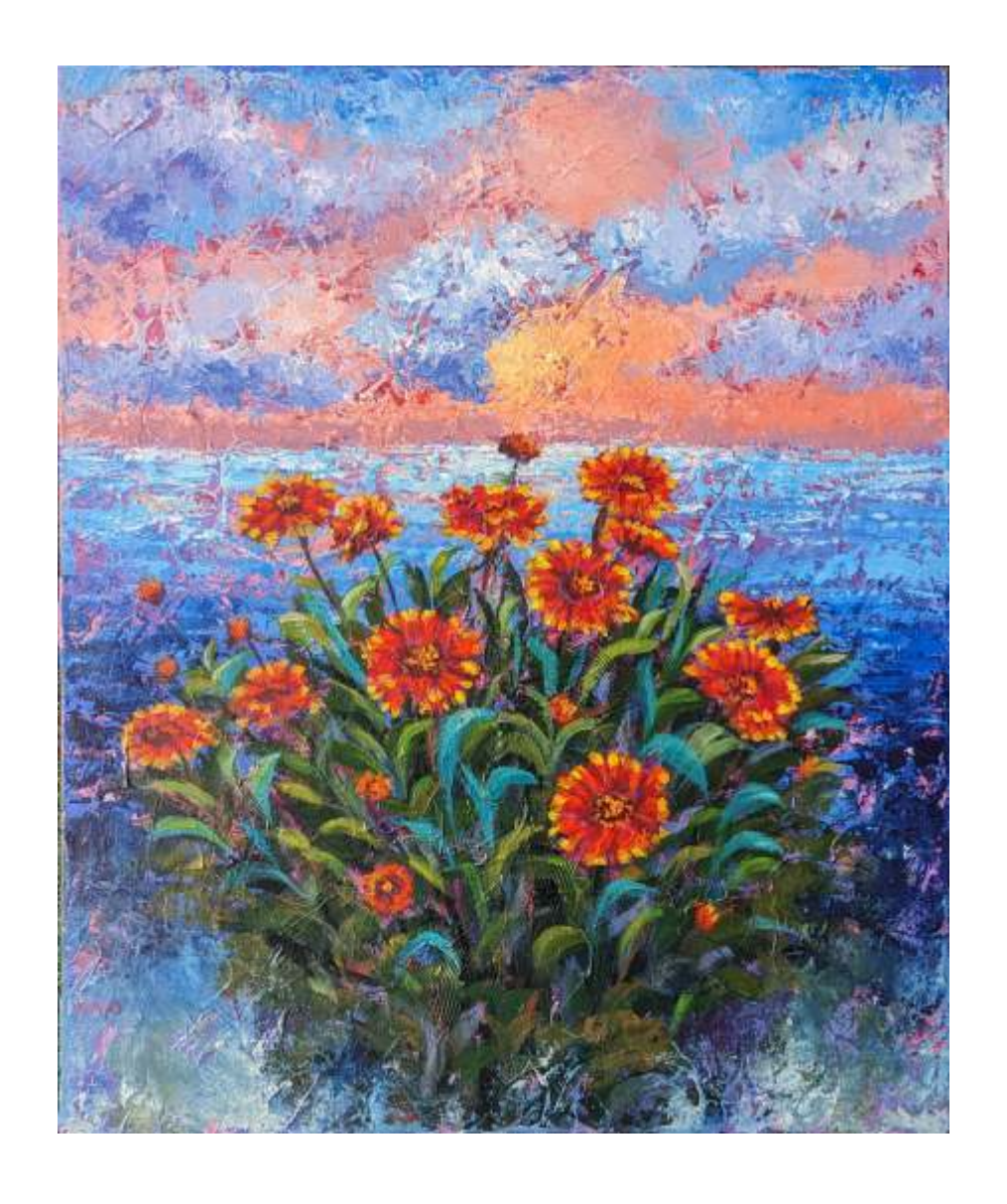
Breezy Evening Material and Medium: Acrylic on Canvas