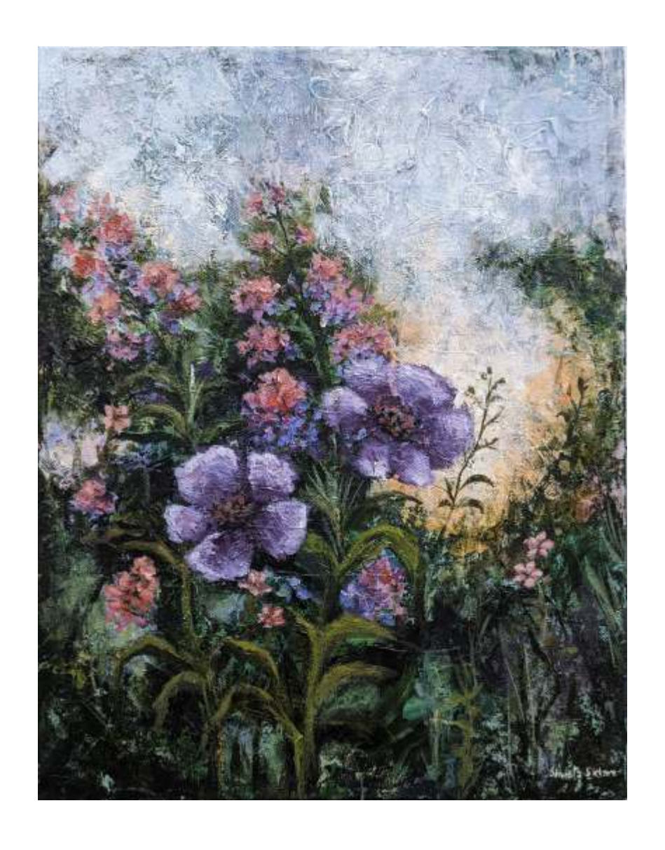
Evening Love Material and Medium: Acrylic on Canvas