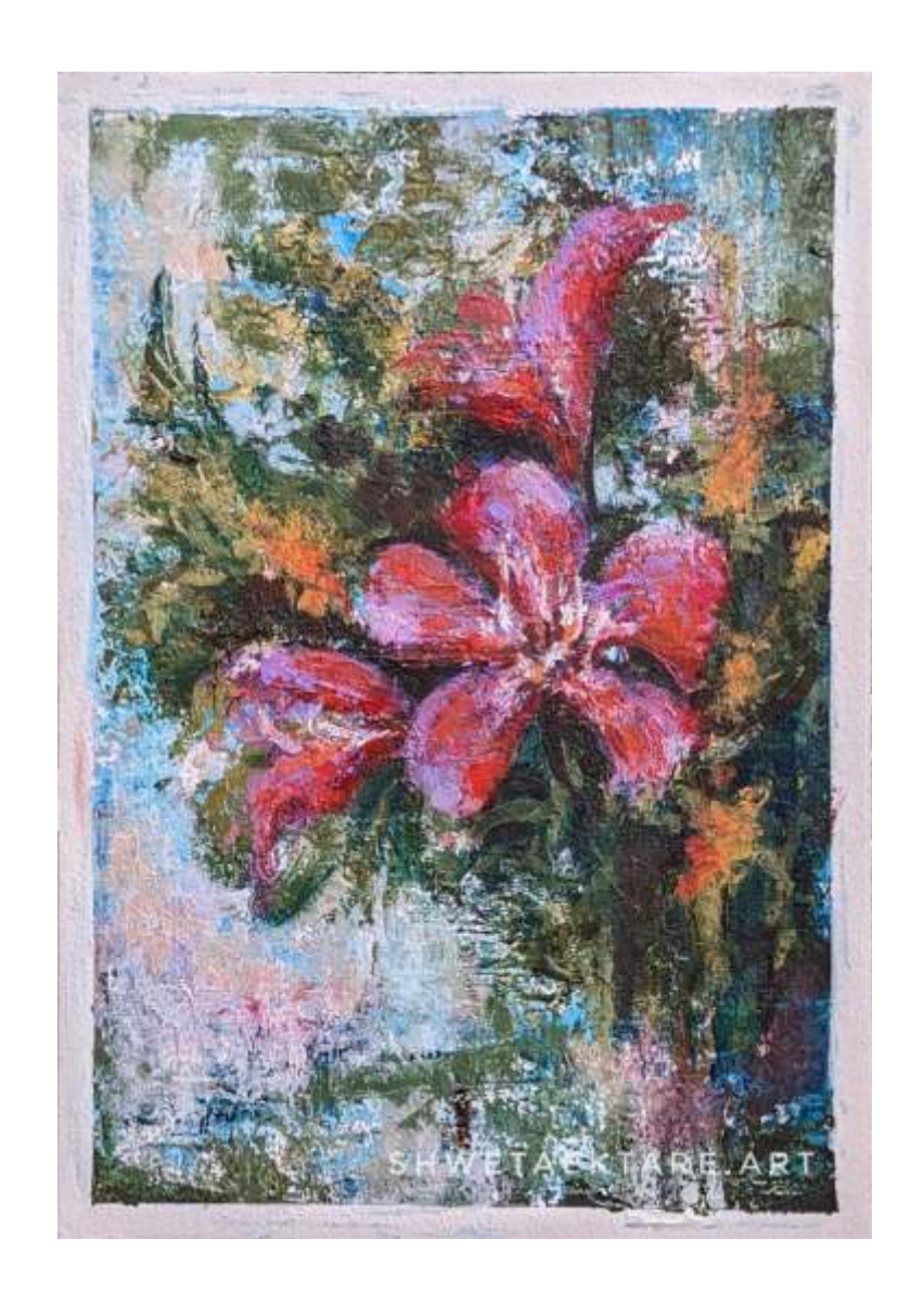
Garden of Serenity Material and Medium: Acrylic on Mixed Medium Paper Size: 7x10" (without frame)