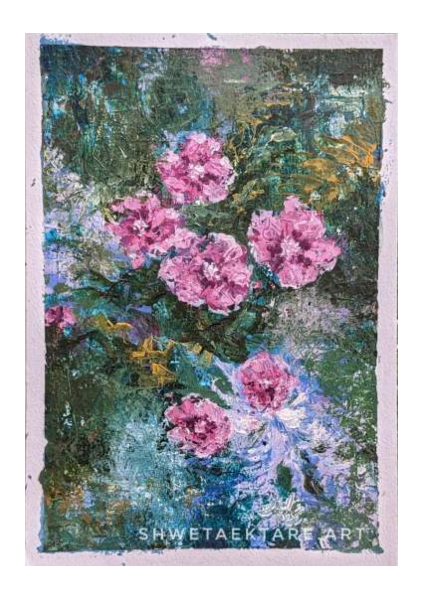
Pink Blush Material and Medium: Acrylic on Mixed Medium Paper Size: 7x10" (without frame) Rs.7,840/-