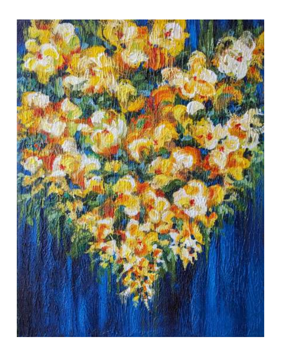
Cascading Yellows Material and Medium: Acrylic on Canvas