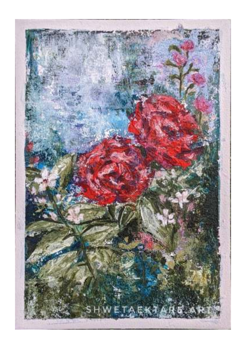
Reds of Manali Material and Medium: Acrylic on Mixed Medium Paper Size: 7x10"(without frame)