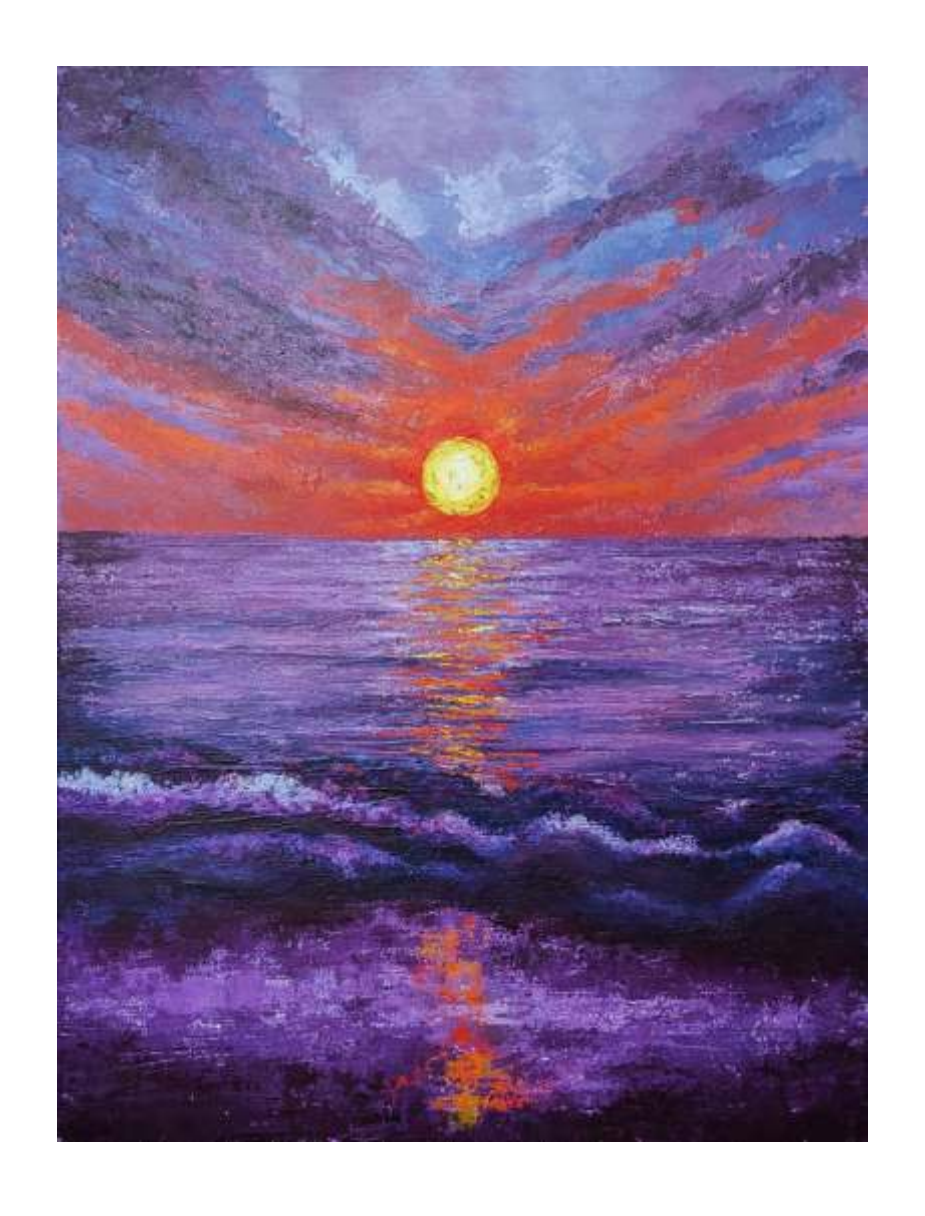
Vibrant Evenings Material and Medium: Acrylic on Canvas