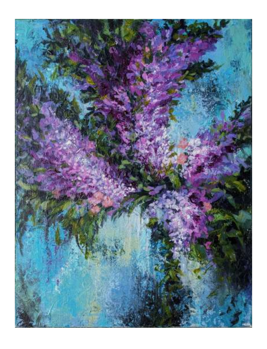
Sweet Evening Material and Medium: Acrylic on Canvas