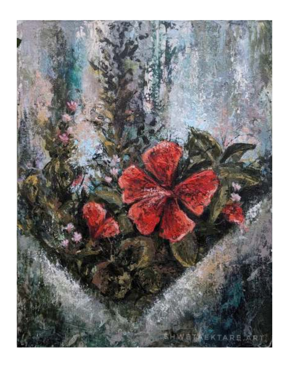
Royal Hibiscuss Material and Medium: Acrylic on Canvas