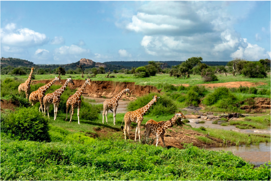
Title : DISCIPLINED MARCH -KENYA | SIZE 20" X 30" Medium : Hahnemuhle Daguerre canvas | Price : Rs. 15,680/-