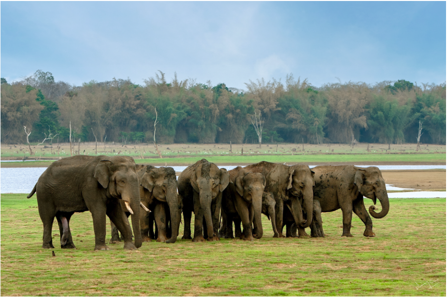
Title : HERD OF ASIATIC ELEPHANTS -NAGARAHOLE, INDIA | SIZE : 20"X 30"

Medium : Hahnemuhle Daguerre canvas | Price- Rs 15,680/-