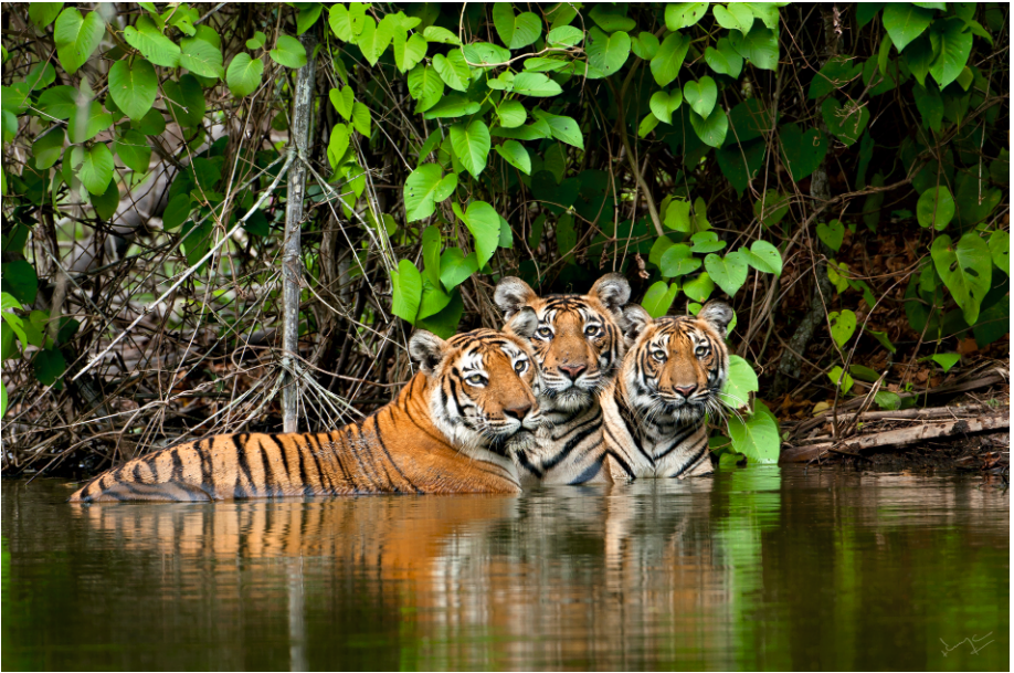
Title : FAMILY PORTRAIT – BANDIPUR, INDIA | SIZE : 20"X 30" Medium : Hahnemuhle Daguerre canvas | Price- Rs. 15,680/-