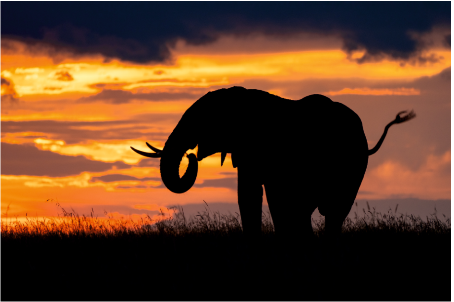
Title : SILHOUTTE OF AN AFRICAN EELPHANT - KENYA | SIZE : 14"X 21" Medium : Hahnemuhle Daguerre canvas | Price- Rs. 7,840/-