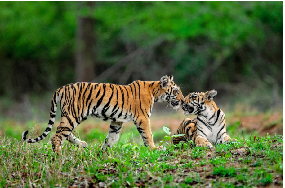
Title : SIBLING LOVE - ADOBA, INDIA | SIZE : 14"X 21" Medium : Hahnemuhle Daguerre canvas | Price : Rs. 7,840/-