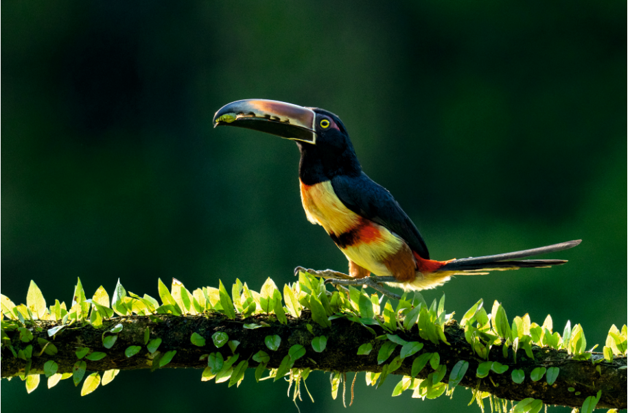
Title : COLLARED ARACARI - COSTA RICA | SIZE : 14"X 21" Medium : Hahnemuhle Daguerre canvas | Price : Rs. 7,840/-