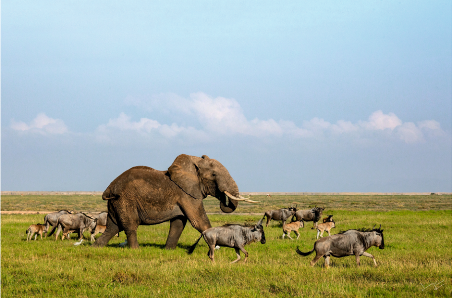
Title : COEXISTENCE - KENYA | SIZE : 20"X 30"

Medium : Hahnemuhle Daguerre canvas | Price- Rs 15,680/-