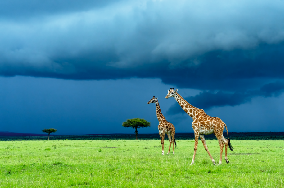
Title : CALM BEFORE THE STORM - GIRAFFE PAIR- KENYA | SIZE : 20"X 30" Medium : Hahnemuhle Daguerre canvas | Price- Rs. 15,680/-