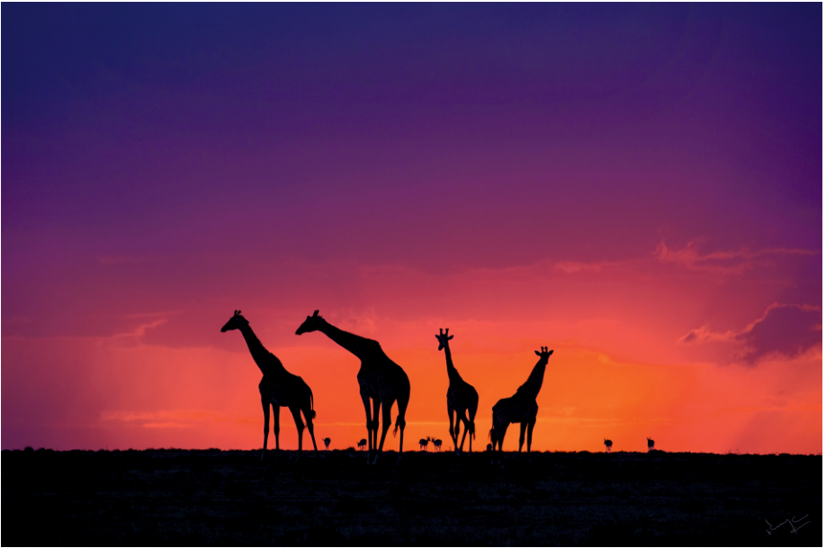
Title : GIRAFFES AND GAZELLES AT DUSK - KENYA | SIZE : 27"X 40" Medium : Hahnemuhle Daguerre canvas | Price : Rs 31,360/-