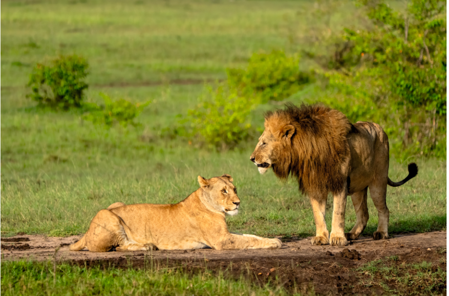
Title : PAIR OF AFRICAN LIONS -KENYA | SIZE : 14"X 21" Medium : Hahnemuhle Daguerre canvas | Price : Rs. 7,840/-