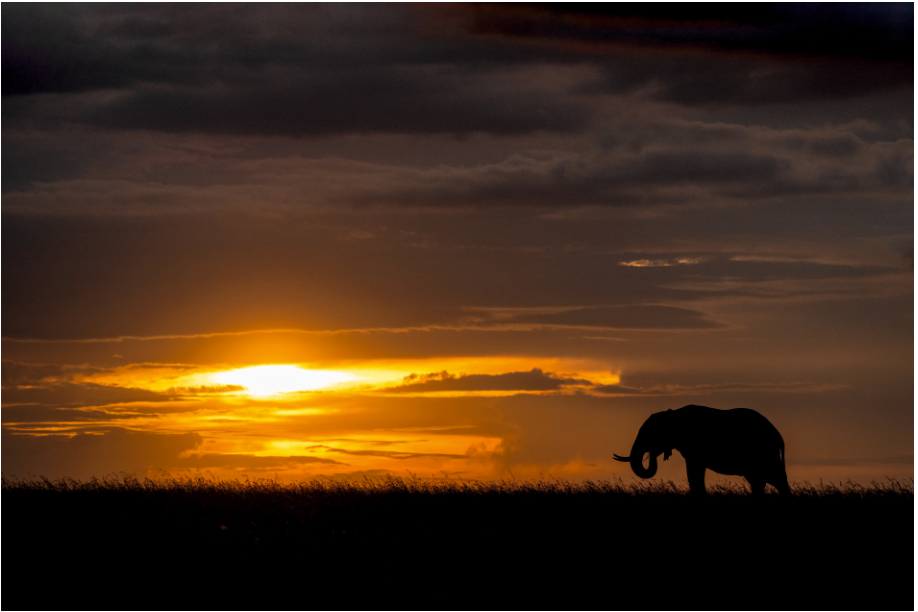
Title: AFRICAN ELEPHANT AT SUNSET - KENYA | SIZE : 20"X 30" Medium: Hahnemuhle Daguerre canvas | Price:-Rs 15,680/-