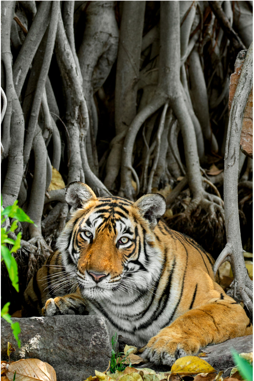
Title: PERFECT PORTRAIT- RANTHAMBHORE, INDIA | SIZE : 20"X 30" Medium : Hahnemuhle Daguerre canvas | Price : Rs.15,680/-