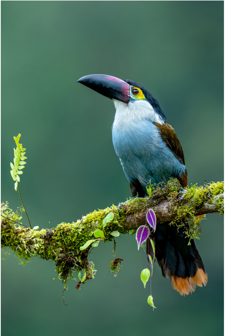
Title : BLACK-BILLED MOUNTAIN TOUCAN -COLOMBIA SIZE : 14" X 21" | Medium : Hahnemuhle Daguerre Canvas Price- Rs. 7,840/-