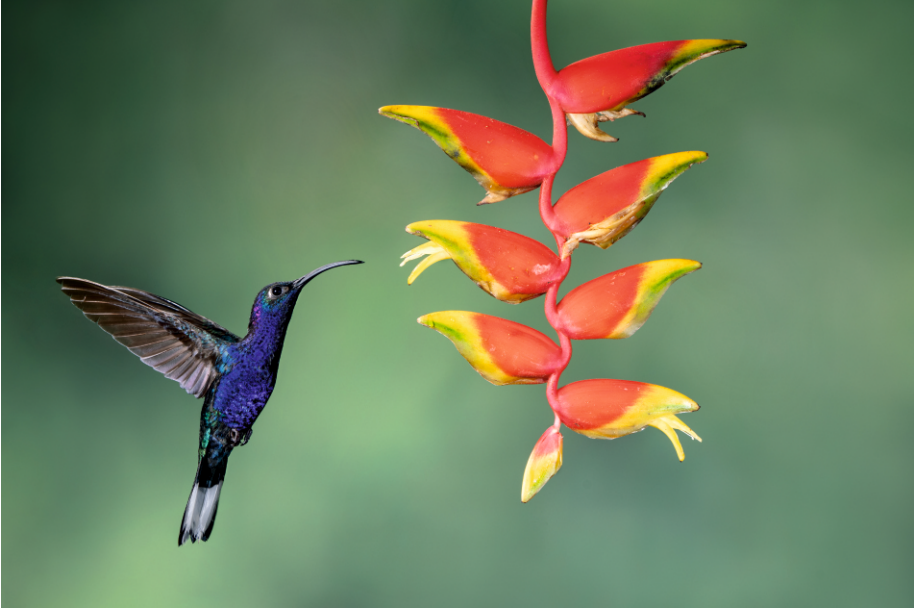
Title : VIOLET SABREWING - COSTA RICA | SIZE : 14" X 21" Medium : Hahnemuhle Daguerre Canvas | Price - Rs. 7,840/-