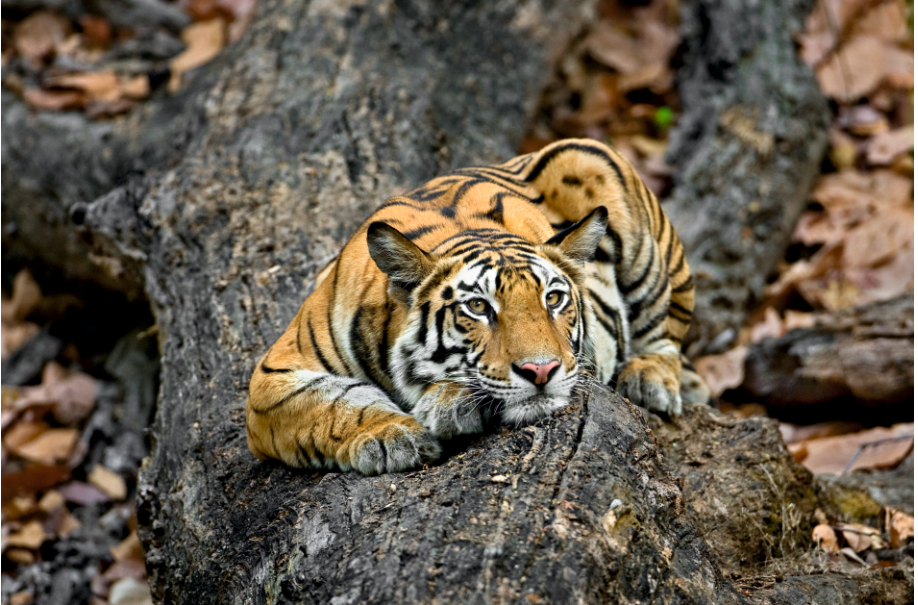
Title : CUTE CUB, BANDHAVGARH -INDIA | SIZE : 14"X 21" Medium : Hahnemuhle Daguerre canvas | Price- Rs. 7,840/-