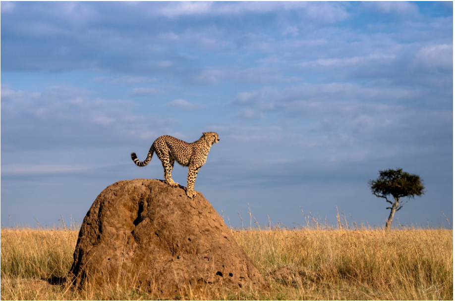
Title : CHEETAH ON THE MOUND- KENYA | SIZE : 20"X 30" Medium : Hahnemuhle Daguerre canvas | Price- Rs 15,680/-