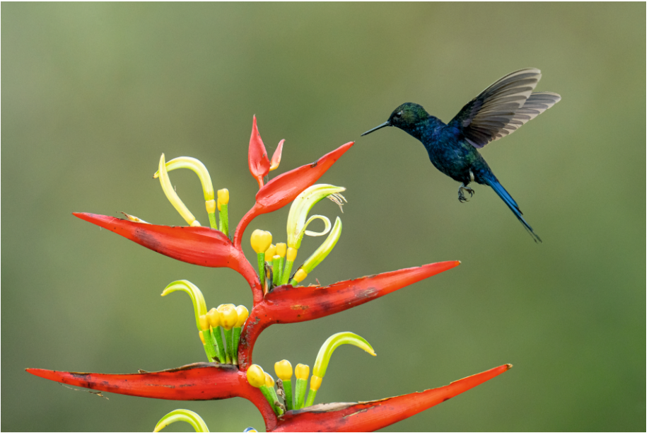
Title : ROYAL SUNANGEL - ECUADOR | SIZE : 14"X 21" Medium : Hahnemuhle Daguerre canvas | Price : Rs. 7,840/-