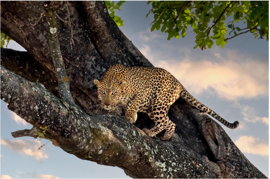
Title: ALERT LEOPARD ON THE TREE, BOTSWANA | SIZE : 20"X 30" Medium: Hahnemuhle Daguerre canvas | Price: Rs. 15,680/-