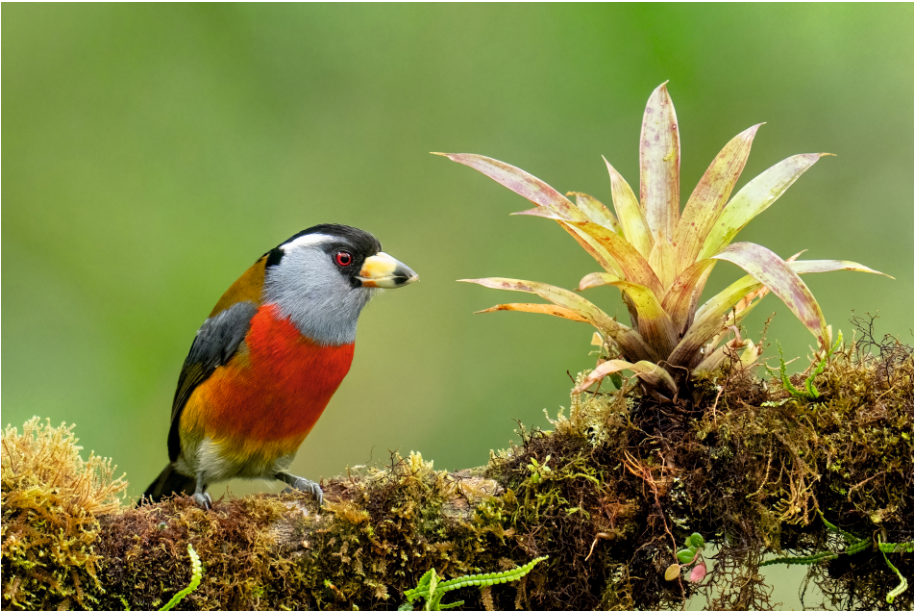
Title : TOUCAN BARBET - ECUADOR | SIZE : 14" X 21" Medium : Hahnemuhle Daguerre canvas | Price : Rs. 7,870/-