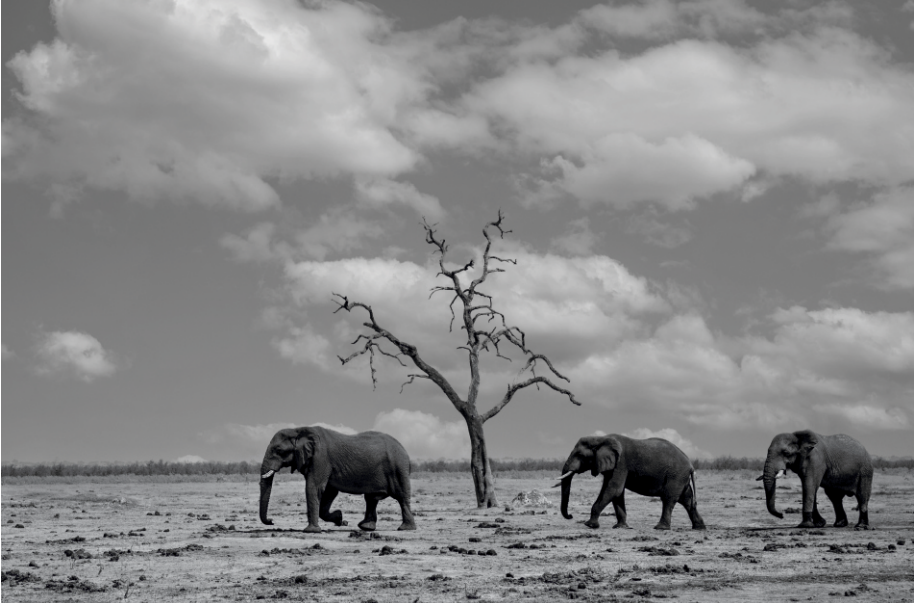
Title : MARCH OF ARICAN ELEPHANTS - BOTSWANA | SIZE : 20"X 30" Medium : Hahnemuhle Daguerre canvas | Price- Rs. 15,680/-