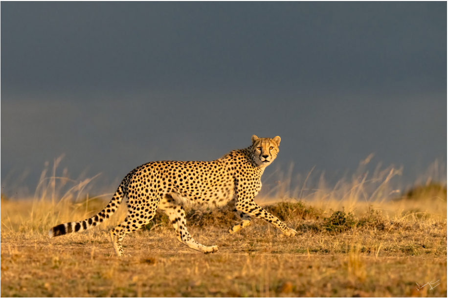
Title : CHEETAH ON THE RUN-KENYA | SIZE : 20"X 30" Medium : Hahnemuhle Daguerre canvas | Price- Rs 15,680/-