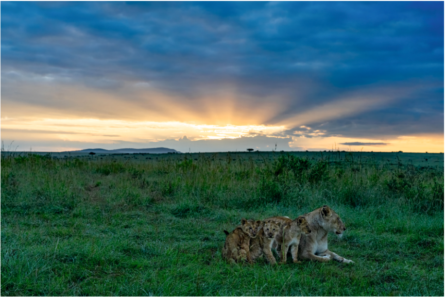
Title : LIONESS WITH CUBS AT SUNRISE - KENYA | SIZE : 20"X 30" Medium : Hahnemuhle Daguerre canvas | Price : Rs. 15,680/-