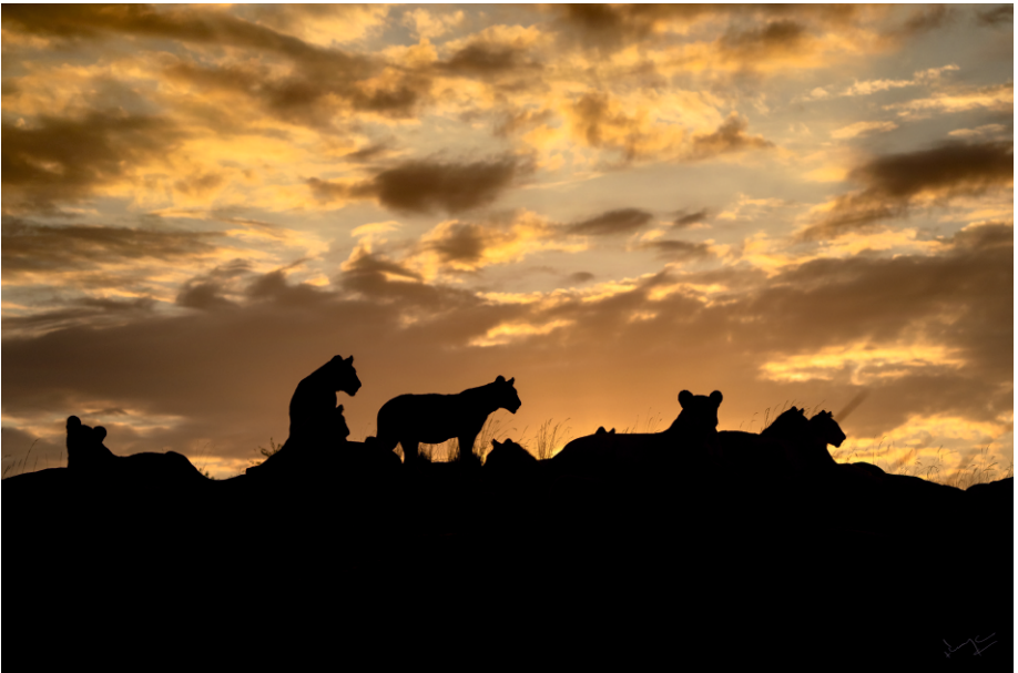
Title: AFRICAN LION PRIDE AT DAWN, KENYA | SIZE : 20"X 30" Medium: Hahnemuhle Daguerre canvas | Price: Rs. 15,680/-