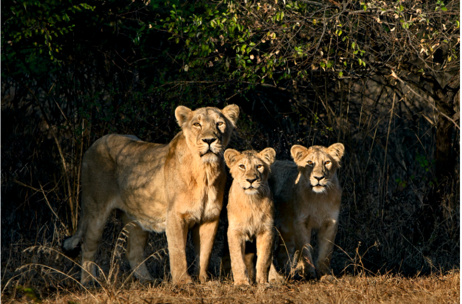
Title: ASIATIC LIONESS WITH CUBS, GIR-INDIA | SIZE : 14"X 21" Medium : Hahnemuhle Daguerre canvas | Price : Rs. 7,840/-