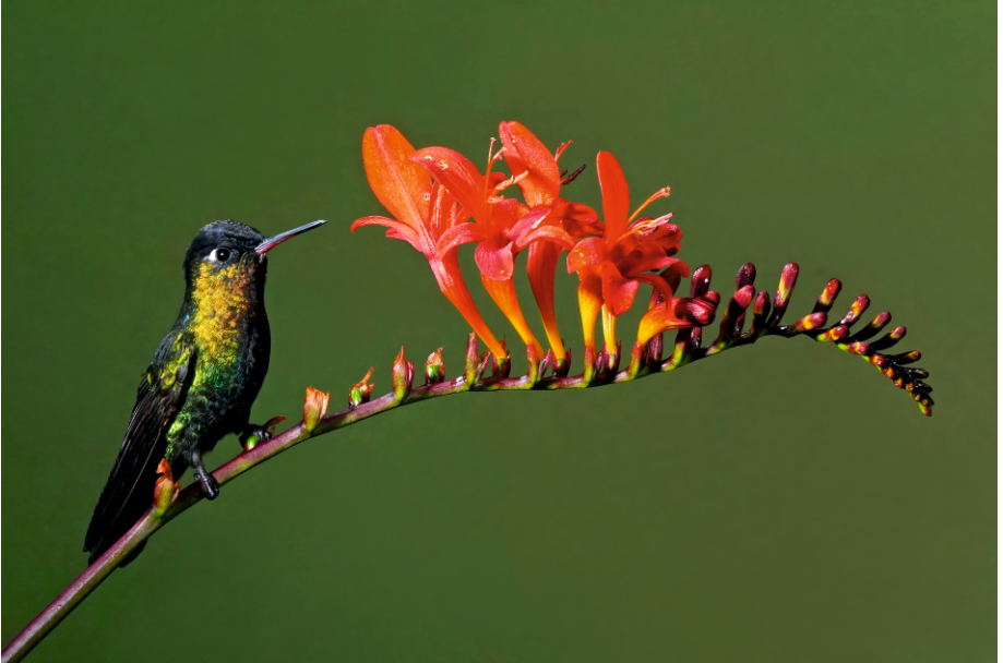
Title : FIERY-THROATED HUMMINGBIRD - COSTA RICA | SIZE - 14"X 21" Medium - Hahnemuhle Daguerre canvas | Price : Rs. 7,840/-