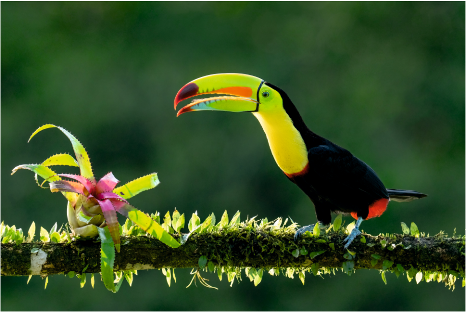
Title : KEEL-BILLED TOUCAN - COSTA RICA | SIZE : 14"X 21" Medium : Hahnemuhle Daguerre canvas | Price : Rs. 7,840/-