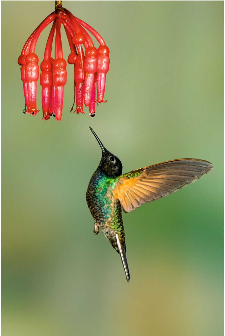
Title : VELVET PURPLE CORONET - COSTA RICA SIZE : 14" X 21" | Medium : Hahnemuhle Daguerre canvas Price : Rs. 7,840/-