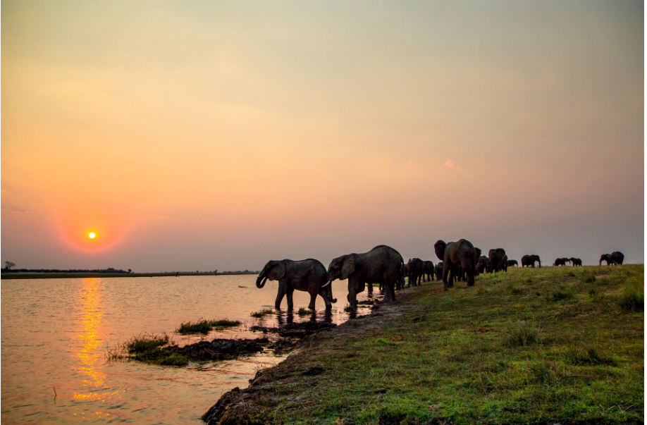
Title: AFRICAN ELEPHANT HERD AT SUNSET- BOTSWANA | Size: 20"X 30" Medium: Hahnemuhle Daguerre Canvas | Price: Rs. 15,680/-