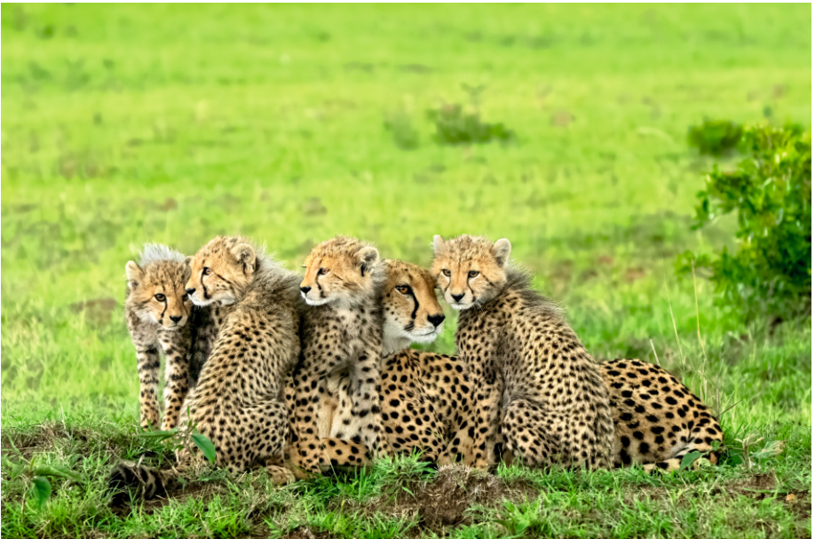
Title : CHEETAH FAMILY IN A HUDDLE- KENYA | SIZE : 14"X 21" Medium : Hahnemuhle Daguerre canvas | Price : Rs. 7,840/-