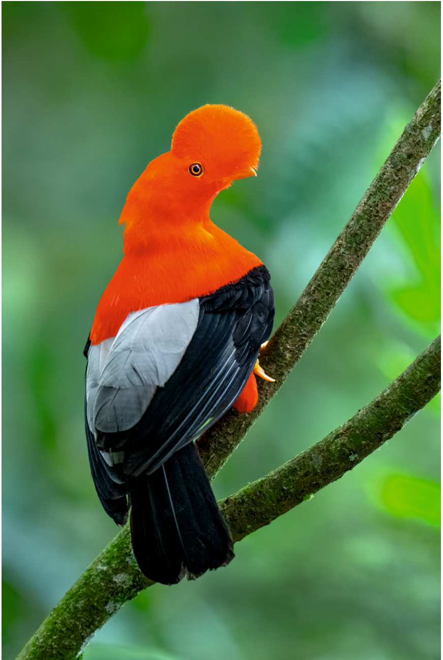
Title : COCK OF THE ROCK - COLOMBIA | SIZE : 14" X 21" Medium : Hahnemuhle Daguerre canvas | Price : Rs. 7,840/-