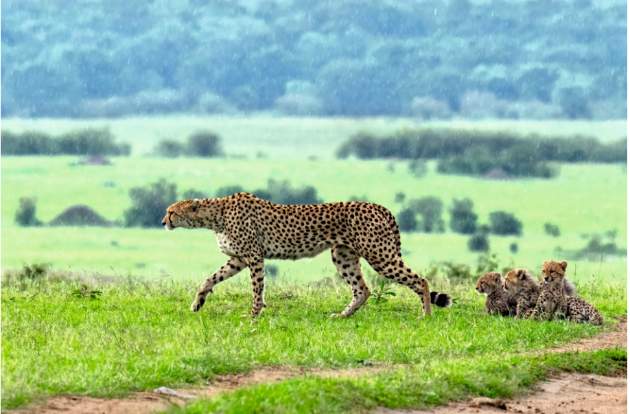
Title : CHEETAH WITH CUBS IN RAIN - KENYA | SIZE : 20"X 30" Medium : Hahnemuhle Daguerre canvas | Price : Rs. 15,680/-