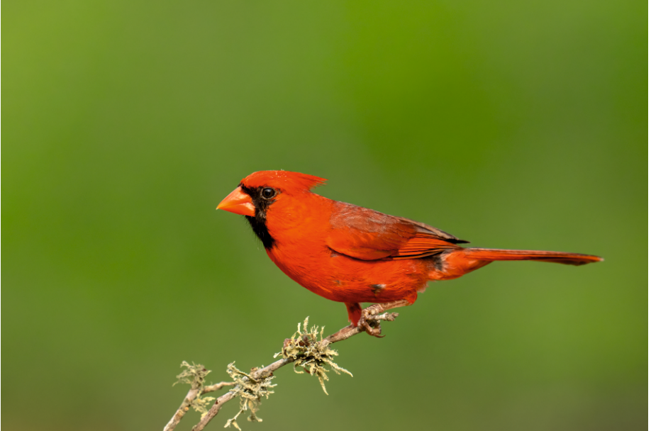
Title : NORTHERN CARDINAL - TEXAS, USA | SIZE : 14" X 21" Medium : Hahnemuhle Daguerre canvas | Price- Rs. 7,840/-