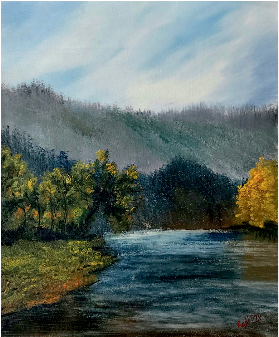
Title: RIVULET Size: 16x 14 inches Medium: Oil on Canvas Price: Rs. 31,360/-