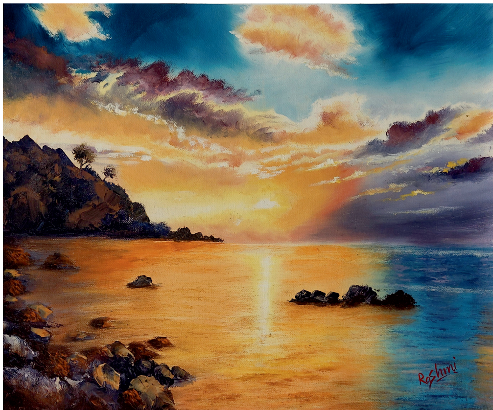
Title: TWILIGHT Size: 14 x 17 inches Medium: Oil on Canvas Price: Rs.31,360/-