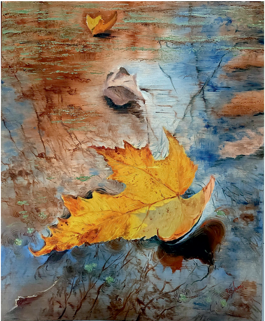
Title: YELLOW LEAF Size: 18 x 24 inches Medium: Oil on Canvas Price: Rs. 54,880/-