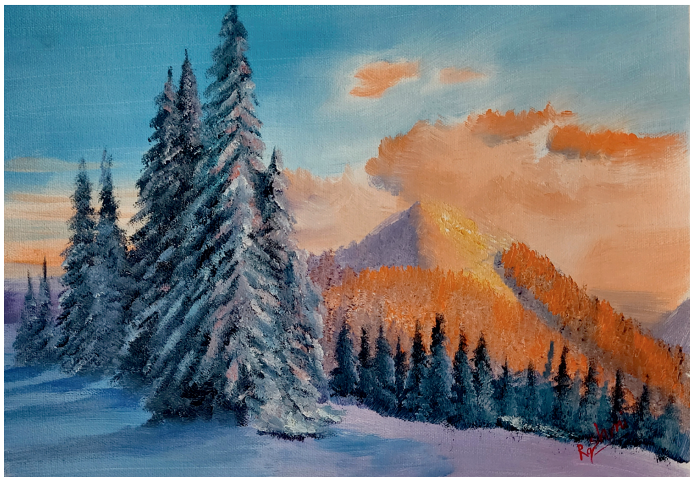
Title: SNOW CAPPED Size: 10 x 14 inches Medium: Oil on Canvas Price: Rs. 23,520/-