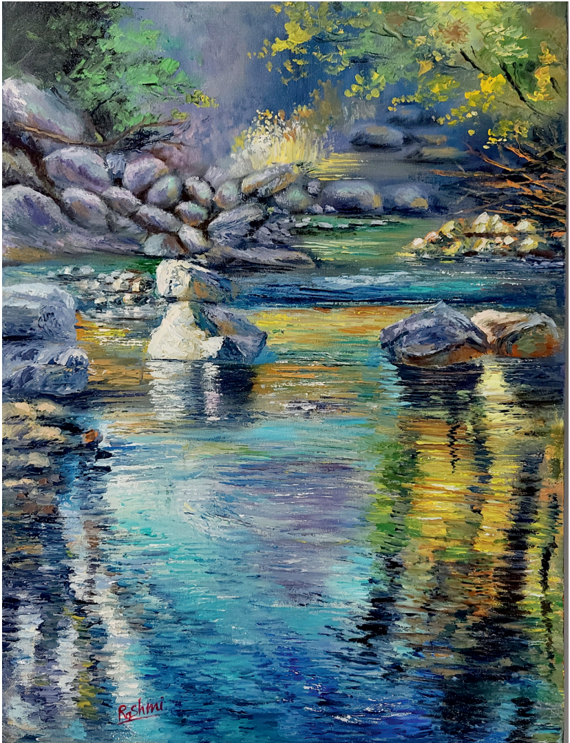
Title: QUIETUDE Size: 18 x 24 inches Medium: Oil on Canvas Price: Rs. 47,040/-