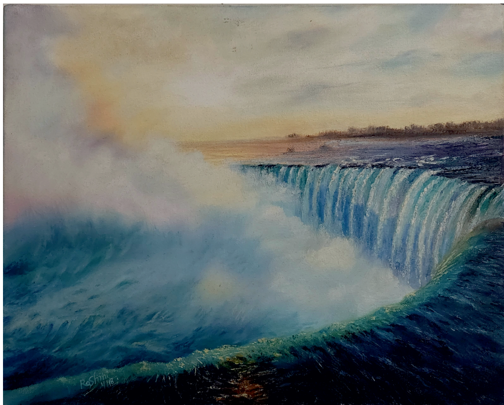
Title: VEIL OF MIST Size: 16 x 20 inches Medium: Oil on Canvas Price: Rs.31,360/-