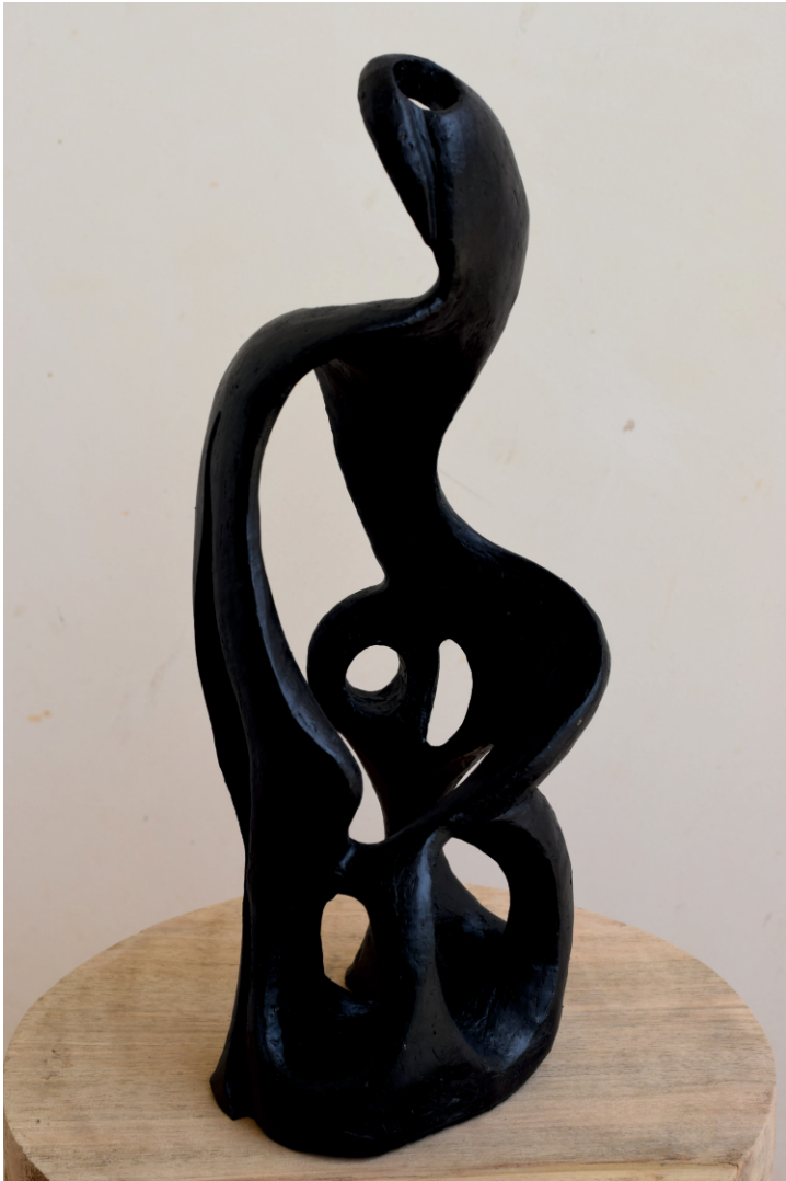
Title: The Fusion Medium: Terracotta Size: 15 x 06 x 06 inch Price: 66,080/-