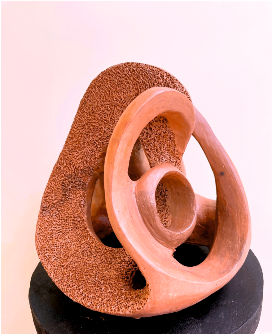
Title: Wave of Rhythm Medium: Terracotta Size: 8.5 x 9.5 x 6 inch Price: 1,98,240/-