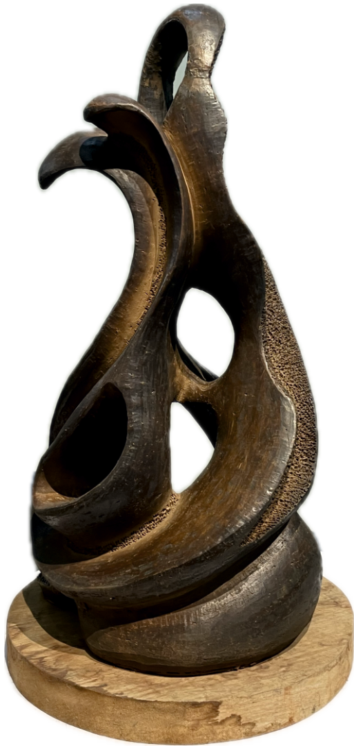
Title: Prafullam Medium: Terracotta Size: 20 x 14 x 14 inch Price: 5,78,200/-