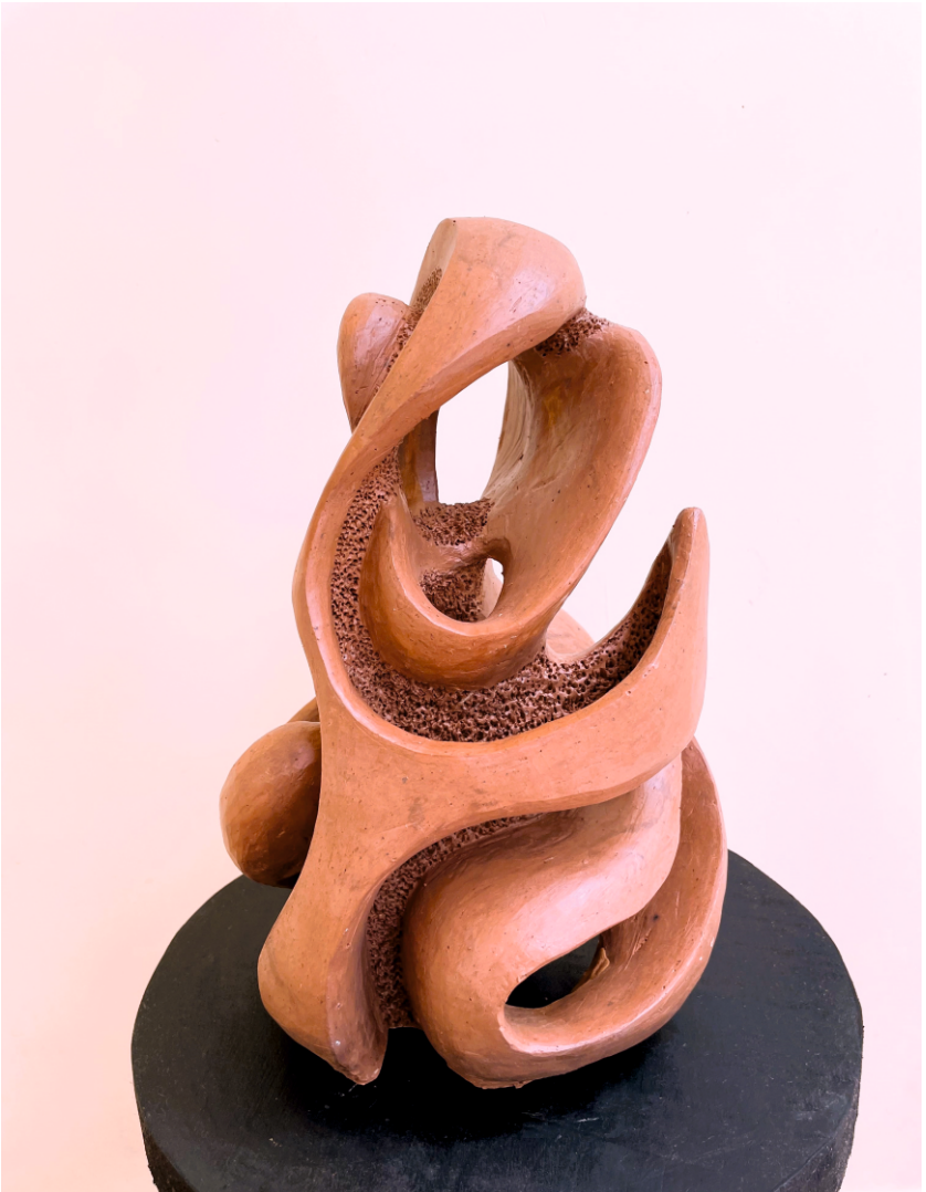
Title: Wave of Affection Medium: Terracotta Size: 7.5 x 11.5 x 7.5 inch Price: 1,98,240/-