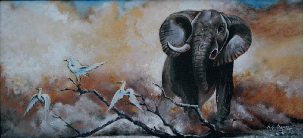
Name : Silent Thunder Size : 20" x 10" Medium : Oil on Canvas Price : Rs. 22,050/-